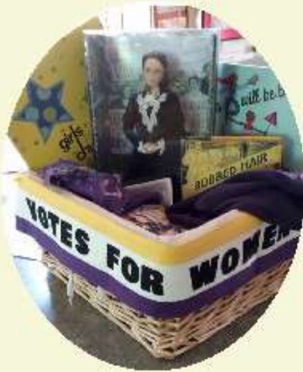
Unique Silent Auction Items