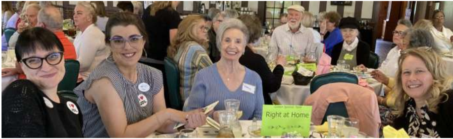
Smiling faces of the Symposium attendees held on April 16th.