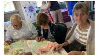
Many individual responses written on Evaluation Forms

AARP, County Department on Aging, Business and Professional Women’s Group, Harmony Garden Music Therapy Services, Jackson District Library, City Recreation Department Active Living Program, YMCA, Lions Club, Orthopaedic Rehab Specialists Physical Therapy, Right at Home In-home Care, and Thome Pace. Everyone went home with lots of information in their spring colored Symposium bags.