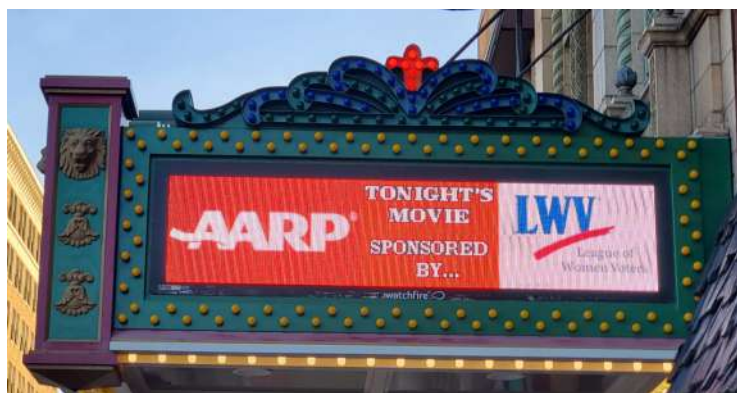
LWVJA name in lights