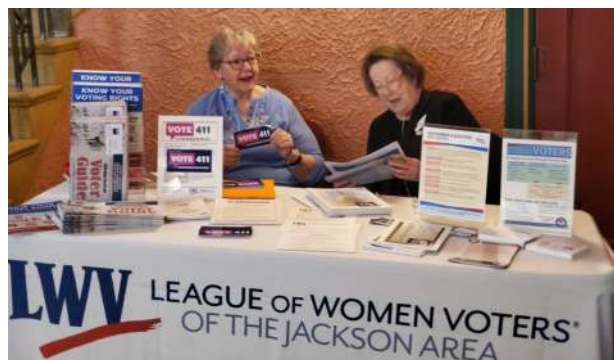
As viewers left, many took our new yard signs and VOTE411 car decals. Even more took copies of our Print Voter Guide with many thanks. Quite a few comments on how much they depend on the League's VOTE411.org

Check out vote411.org and the League's Voter Guide for all the election information you need.