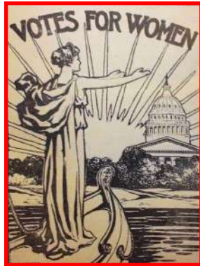
Citizen Patriot Archives May 30, 1976