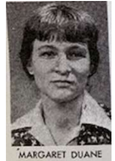
Note that the paper used her first name not her husband's