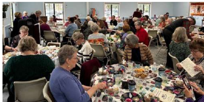
And Door Prizes for All