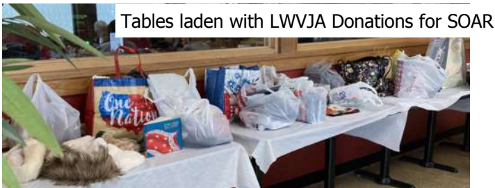
Tables laden with LWVJA Donations for SOAR